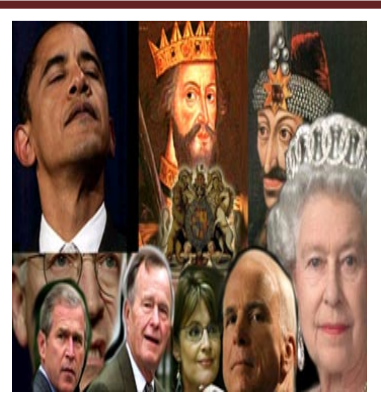
"Covenant With Many"

The Quartet on the Middle East, sometimes called the Diplomatic Quartet or